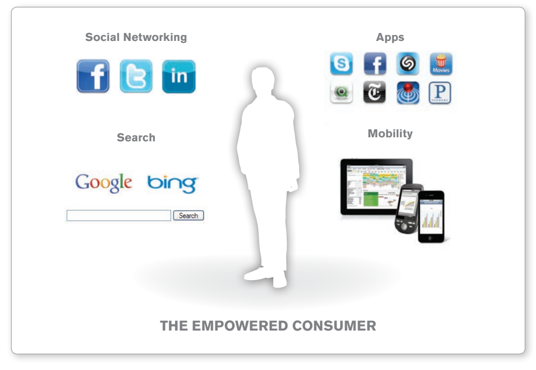
Figure 2: Empowered consumers are driving change